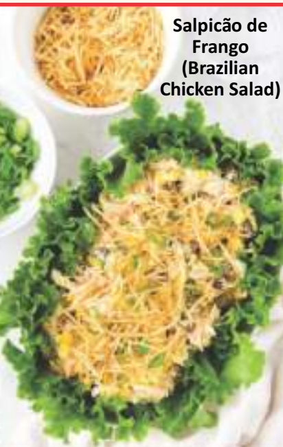
Salpicão de Frango (Brazilian Chicken Salad)