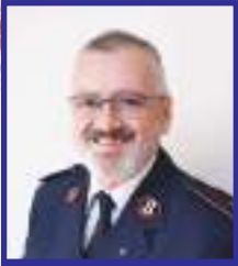
Commissioner Torben Eliassen