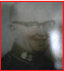
Commissioner Hesketh King

The Salvation Army Hesketh King Treatment Centre, the only one of its kind in Africa, celebrated 75 years of ministry on the property: Klein Joostenberg, in Muldersvlei, near Stellenbosch. HKTC has been a place of help, hope, and healing for hundreds of men, ages 16 to 65, caught in the devastating cycle of substance abuse.